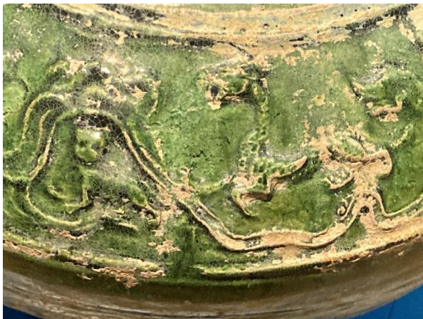
Person (?) in cave and dragon