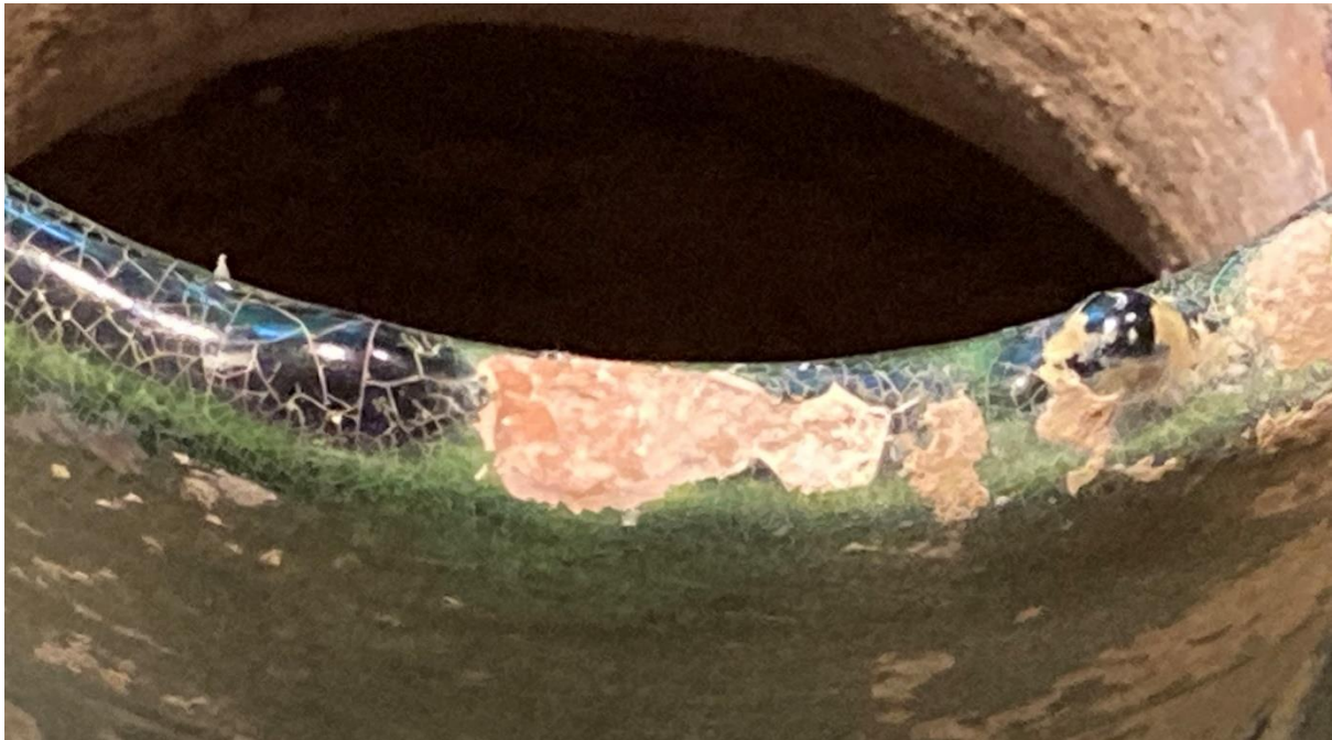
Two glaze drips with a support scar between them

Green was the most common colour for these vessels, though they are also found with various shades of brown glaze. The green coloration comes from the addition of copper to the glaze. Chemical analysis of these green glazes shows that they also contain some tin, which suggests that the copper comes from oxidised bronze – possibly a by-product of a bronze foundry? On my pot there is a subtle vertical streaking in the glaze, which indicates that it flowed under the effect of gravity during the firing. This is confirmed by the observation of drops of glaze which have formed on the rim of the jar – it must have been fired upside down. The rim also has three scars, 120 degrees apart, where the jar rested on supports in the kiln.