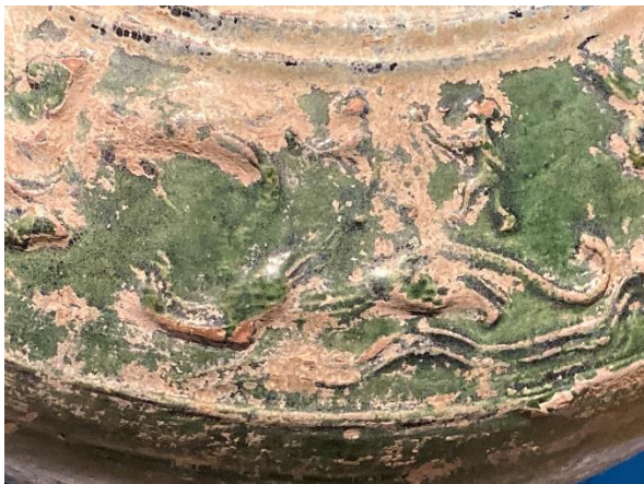
Two monkeys on a crocodile