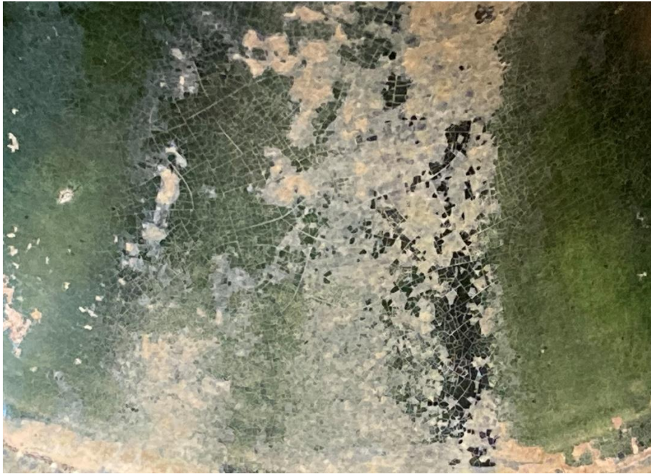
Localised iridescence and flaking

The jar itself was almost certainly made of the clay-like soil that covers much of northern China. Called loess, it is made from dust that has been blown from the Himalayas over the plains of China, in some places lying up to 350 metres thick. Since lead glazes mature at relatively low temperatures (700 to 1000°C) there is a risk that the clay body of the pot will be underfired at this temperature, and the bodies of Han dynasty lead-glazed pots are often quite soft and friable. Indeed, looking at my pot there are several areas where the glaze has been chipped or scratched away to reveal the soft clay body underneath. In fact, I have discovered that can make a scratch in the base of my pot using my fingernail! This was probably not regarded as a problem at the time, since it is likely that this lead glazed earthenware was reserved for burials and not used in the home. Eight hundred years later, in the Tang dynasty – arguably the peak of Chinese lead glazing, they overcame this problem by firing the jar initially to a higher temperature, without the glaze, and then refiring it with the glaze.