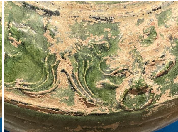
Boar (?) (left) and taotie (right)