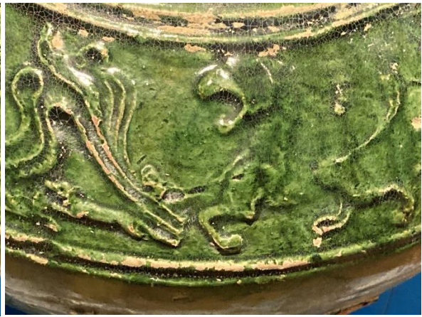
Dog (?) and lion