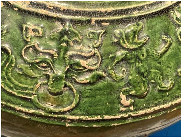
Taotie (left) and bear (right)